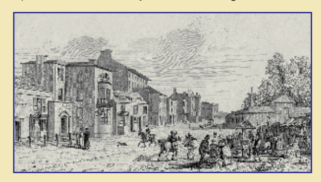
Copps' Hotel, High Street, The Market and Wise's Baths, 1822

and cold bathing, shower baths, a douche bath, a hot air bath and a vapour bath. The business was later taken over by James Gould and renamed Gould's Original Baths and Pump Rooms. Continue up Bath Street to the junction with High Street.