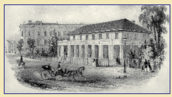
The Royal Pump Room and Victoria Baths, c. 1840