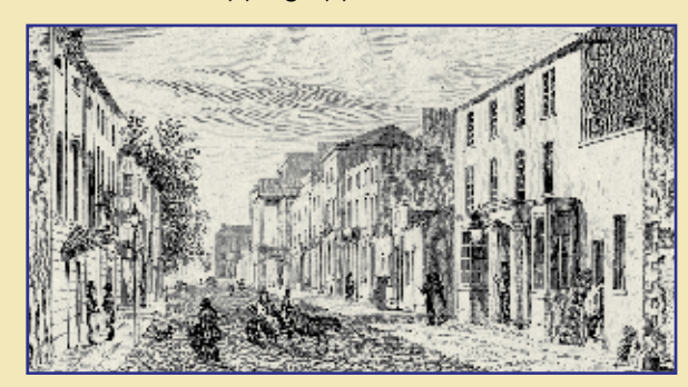
Bath Street, Bath Hotel, Theatre and New Assembly Rooms, 1822

In front of All Saints' Church is the site of the Old Well or Lord Aylesford's Well. A spring used for bathing and drinking was recorded here in 1480. It became renowned for the treatment of hydrophobia (rabies). In 1803 the Earl of Aylesford built a small stone well house; there was a charge for spa water dispensed inside while that outside was free. A new well house was built in 1813, improved in 1828, and rebuilt in 1891. It was demolished in 1961. Since 2007 the sculpture 'Spring' has marked the site of the original well. Cross the road and continue along Bath Street, stopping opposite Gloucester Street.